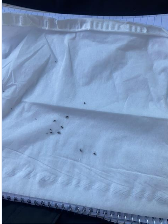
35 Arkose Street