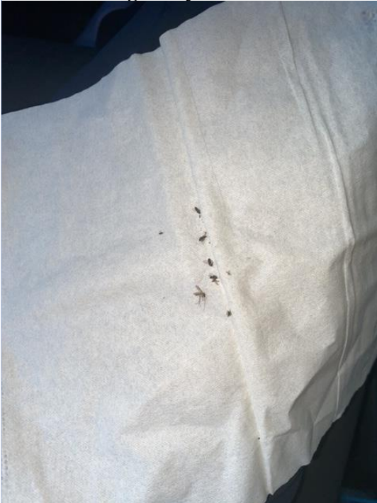
50 Flamborough Way