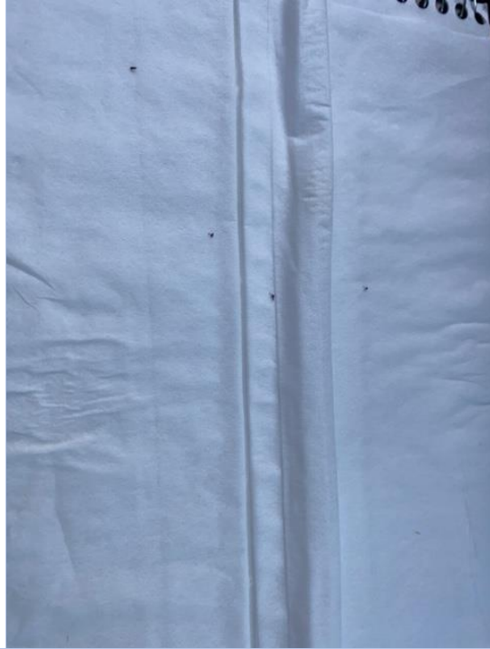
35 Arkose Street