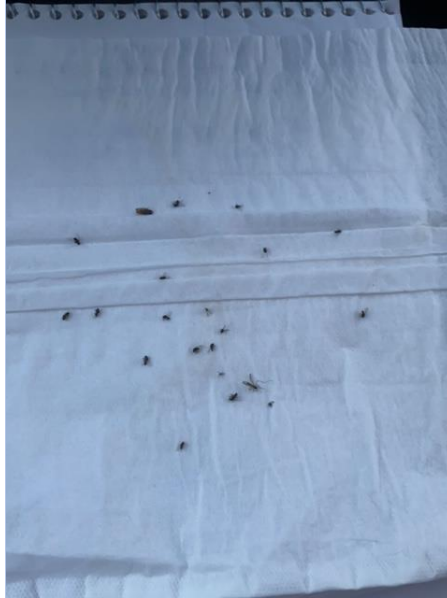
35 Arkose Street